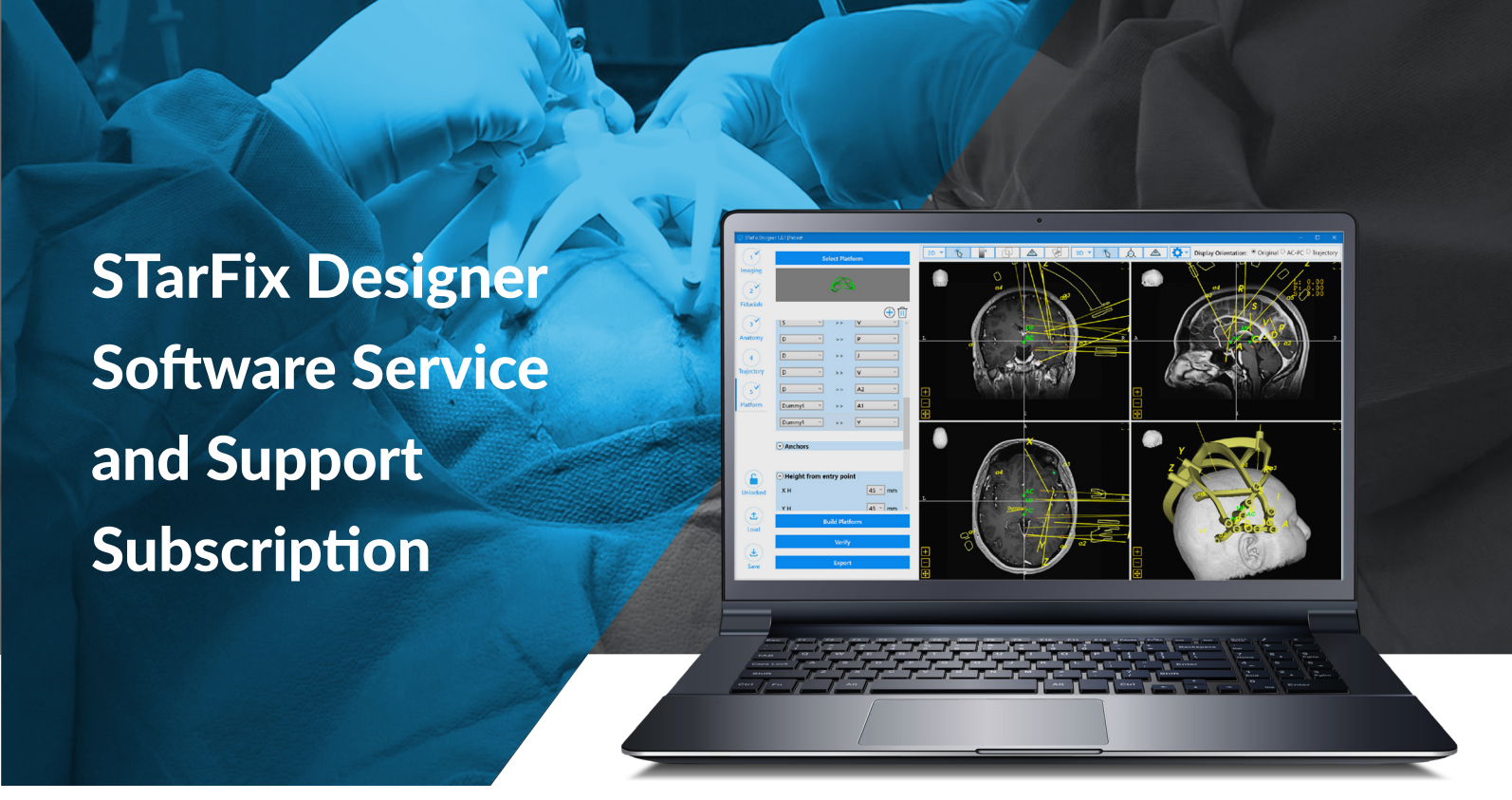
STarFix<sup>™</sup> is a trademark of FHC, Inc.