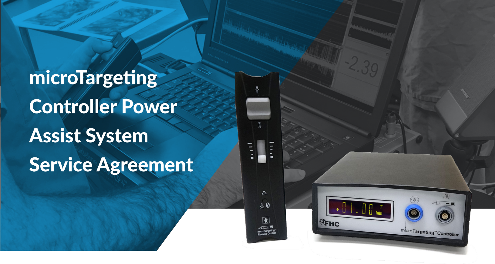
microTargeting™ is a trademark of FHC, Inc.