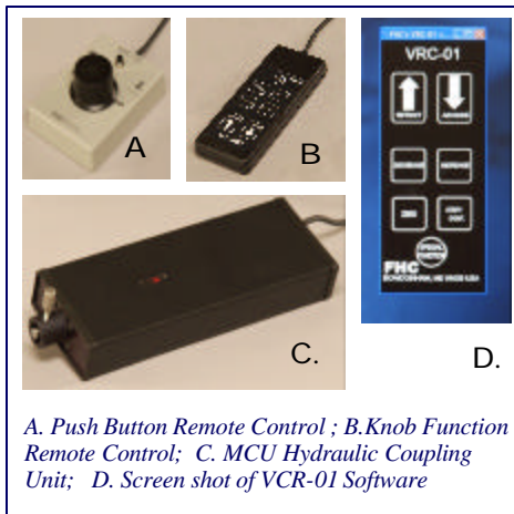
A. Push Button Remote Control ; B. Knob Function Remote Control; C. MCU Hydraulic Coupling Unit; D. Screen shot of VRC-01 Software